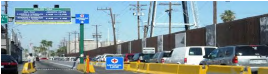
Traffic waits while the Medical Lane remains clear

However, there is a new option to speed the wait through customs when returning to California. Implemented in May of 2012, the US – Mexican border and customs departments have initiated a 'medical tourist' lane. This lane entitled returning patients (with a doctor's note, proper documentation and a small fee) a chance to skip the longer lines when traveling home after receiving care in Mexicali. 7