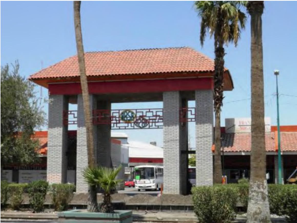
Chinesca, or Mexicali's Chinatown

New York City. Rumors persist of underground communities of Chinese living in these tunnels to this day, being fed and cared for by the Chinesca community.