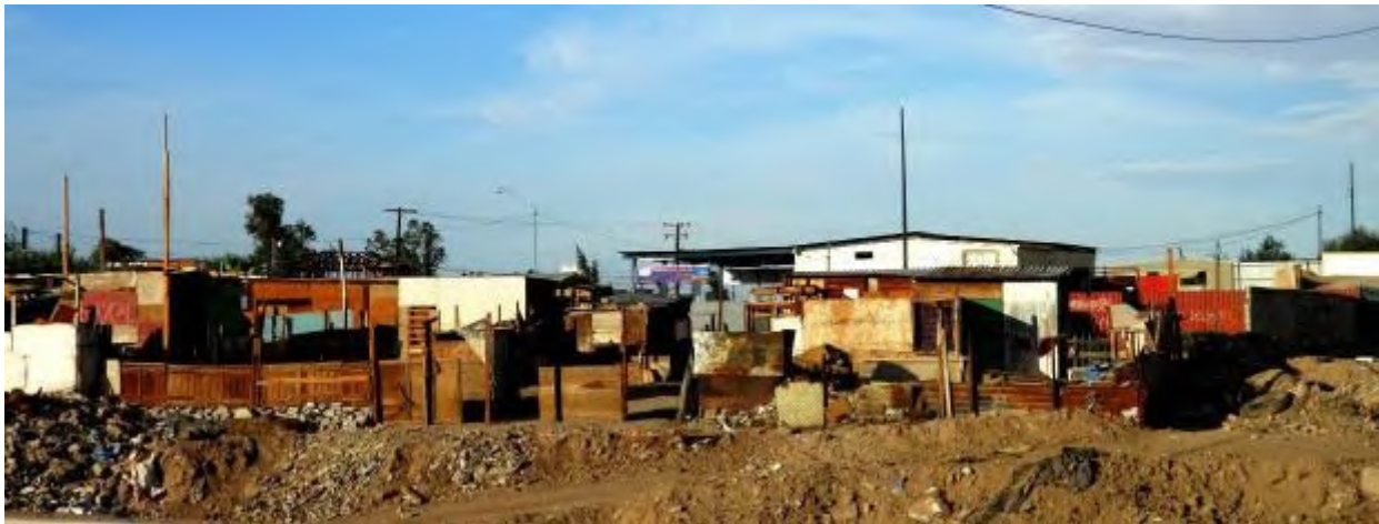
One of the less affluent areas of the city

This is a younger area of Mexicali, which is considered by local Mexicali residents to be the neighborhood of the 'Chicanos' or Hispanic individuals from Los Angeles and similar areas. The area is considered to be a lower socio-economic level, and housing in this neighborhood runs the gamut from well-tended to dilapidated in appearance. On weekends, prostitutes including the transgendered variety and groups of drunken young men are visible on street corners, side streets and outside the bars and billiards clubs in this area. Most locals tend to avoid this area at night, and lone young women in their cars often ignore stop signs late at night when traveling in this neighborhood.