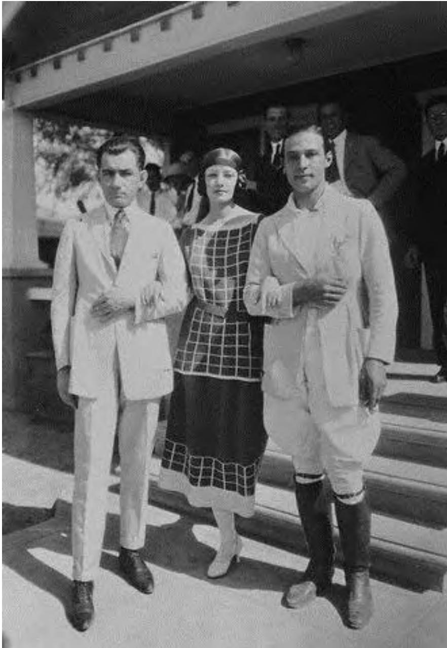
The wedding of Rudolph Valentino, 1922, Mexicali 24