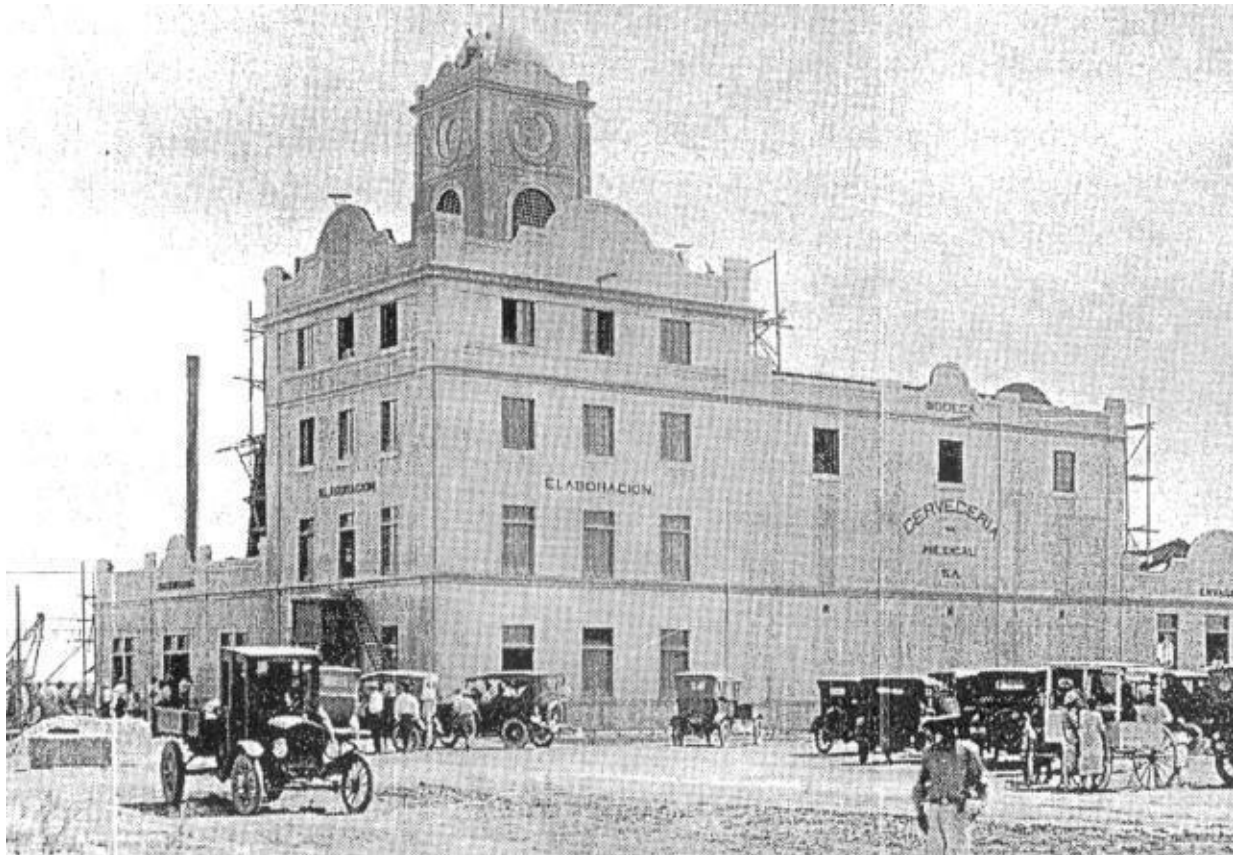
Cerveceria circa 1920's

Mexicali has a long history as the home of bottling, and distribution of beer and other alcoholic beverages. Most famously, Mexicali was the home of the massive Cerveceria which took up an entire block at Calle D and Dr. Gaston Salazar.