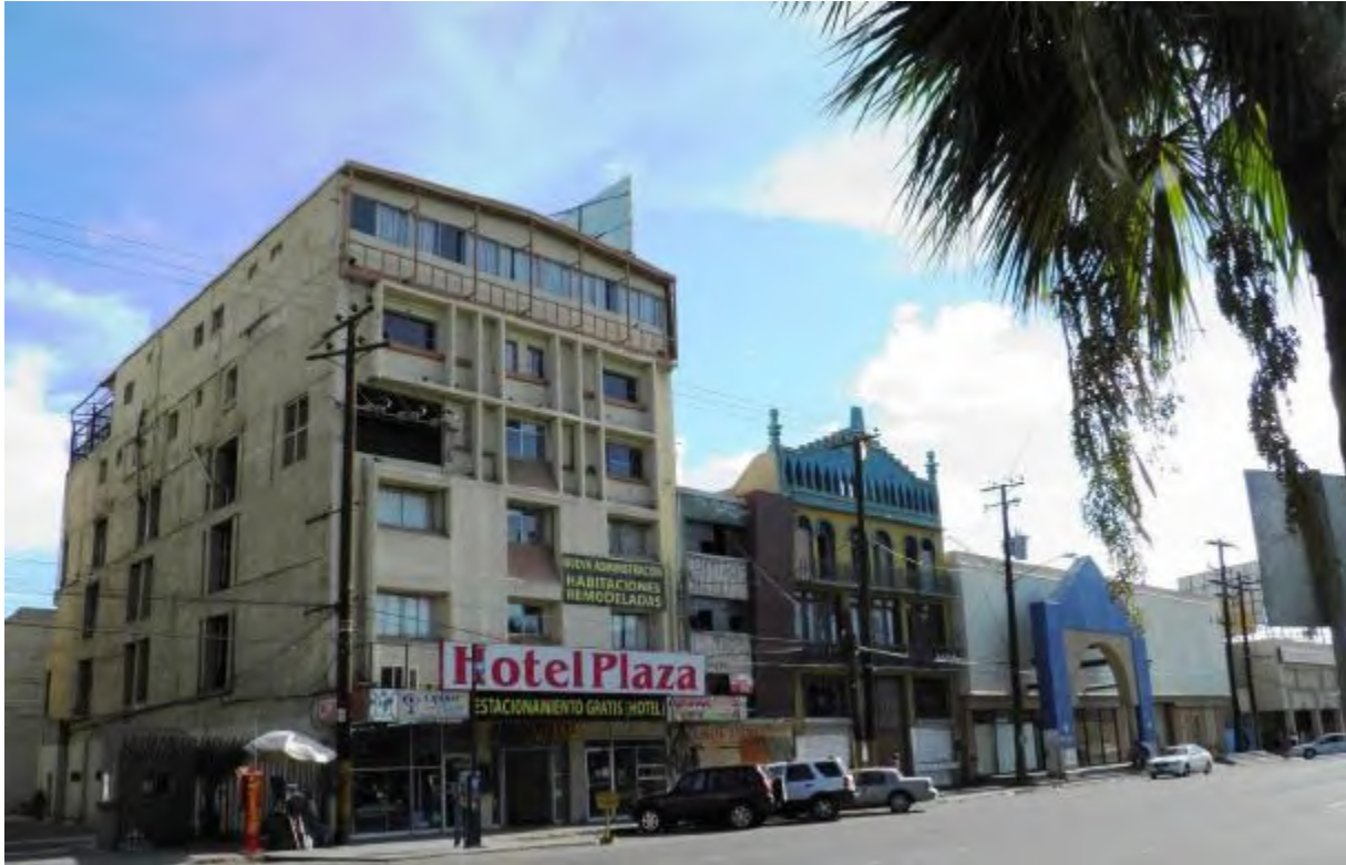
Some of the seedier hotels downtown

Within Zona Centro lies El Hotel Centenario, a former luxury hotel that is now a hostel for deported migrants, as featured in a recent LA Times story, “Without a country.” 45 This lost grandeur is typical for the downtown area.