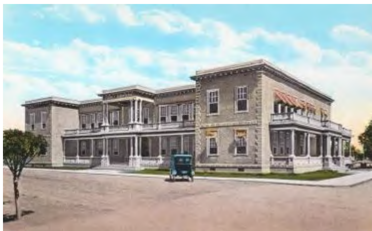
A postcard showing the Cuauhtemoc School in 1915

The school was also the site of a major skirmish at the beginning of the Mexican Revolution. The school was successfully defended by the students, including children as young as 13 years of age. Several of the students were killed in the battle, and have been memorialized at the adjacent park.