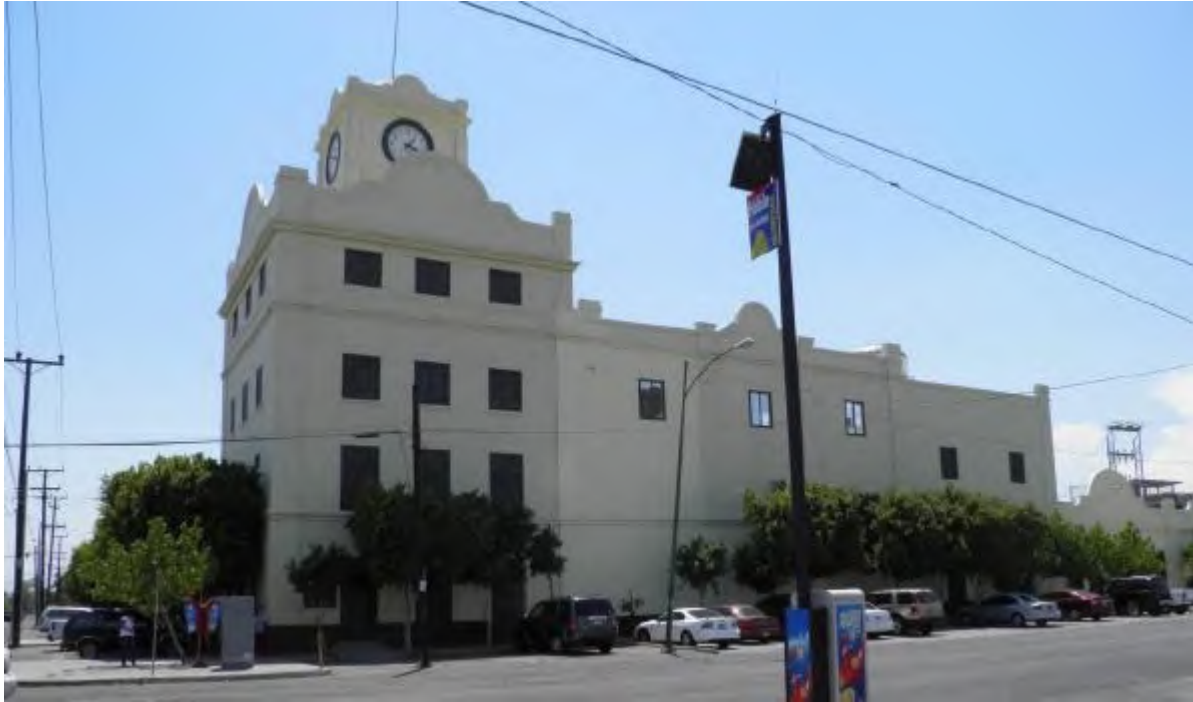
Former cervceria, 2012

Beer drinkers should not despair however, as Mexicali retains an excellent reputation as the home of bottling and distribution plants for several Mexican beers. Cucapa is the local microbrew beer, and is available in several varieties including dark lager, light and honey ale as well as the infamous “Chupacabra” variety. Cucapa is easy to find throughout the city.