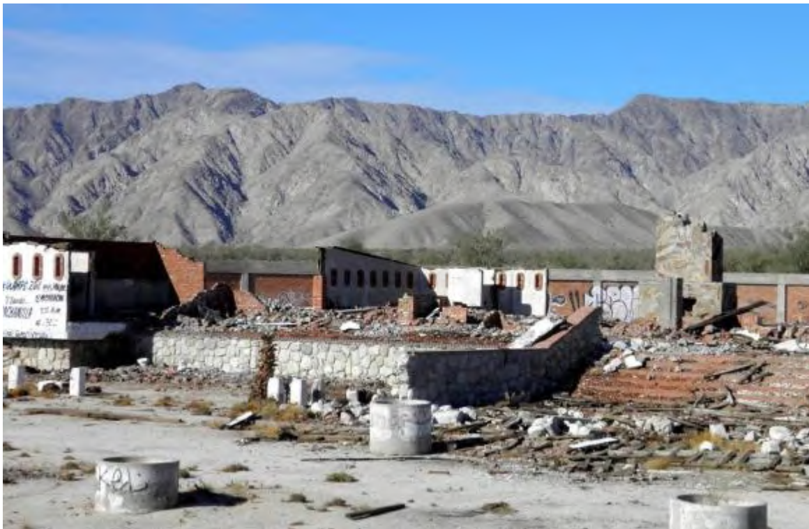
The ruins at the site of the fateful dance

There is also a Mexicali version of Chicago's most famous ghost, "Resurrection Mary." In this vanishing hitchhiker tale, a young woman appears at the side of the road seeking a ride to her home in Mexicali. In various published and oral accounts, dating back to the 1950's, the young woman had been attending a dance in the valley outside of Mexicali. At the dance, she was mortally injured but did not die immediately. In some versions, she was stabbed accidentally during a fight, and in others, she was targeted by a jealous rival. In several of the accounts, the hapless drivers were infatuated with the young hitchhiker and unaware of her ghostly nature at the time of the ride. In these versions, the (male) drivers only became aware of her supernatural side upon returning to her home to ask for a date. On arriving at the home where the young woman had been dropped off previously, they are greeted at the door by the young woman's grieving parents who inform the startled visitors of her demise (several weeks to years) previously. The rumored site of the long-ago dance is several miles outside of Mexicali, toward San Felipe. The building, a former casino, burned several decades ago, adding to the intrigue.