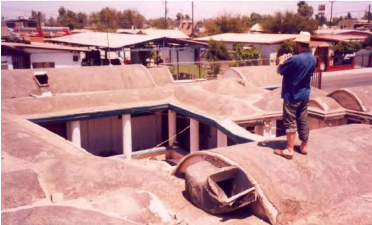
Construction of Mexicali Project