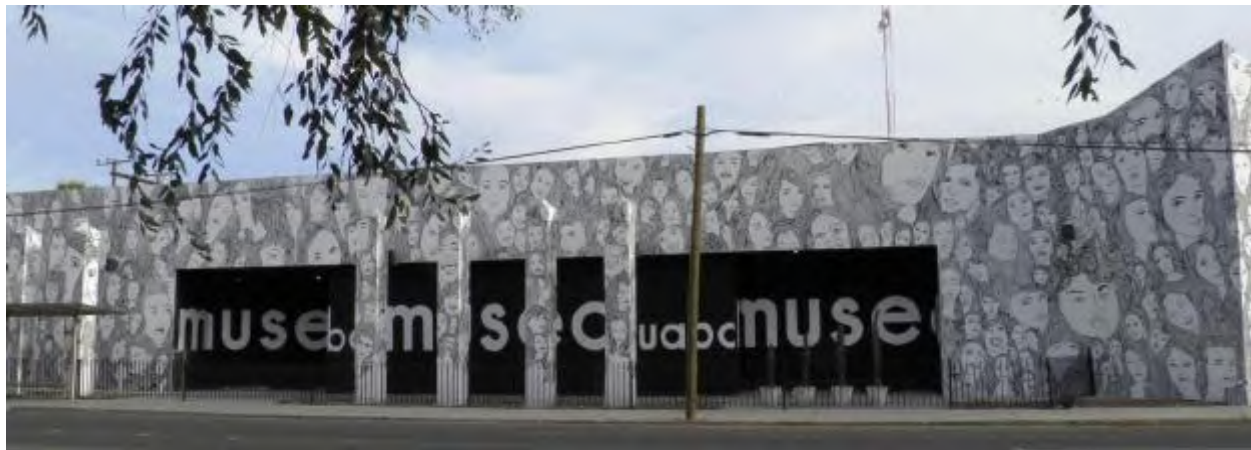
Museum (spring 2012)

While there is no printed information in English, several of the guides speak English and are happy to answer questions. The museum consists of three permanent displays about Baja California, including information about pre-historic finds (fossils), early inhabitants, native tribes, and settlement of the Mexicali area. One of the interesting things about this museum is that even the building serves as a canvas and is frequently repainted to display new art. Adjacent to the museum is both the Institute of Culture of Baja California and the Baja California informational archives.