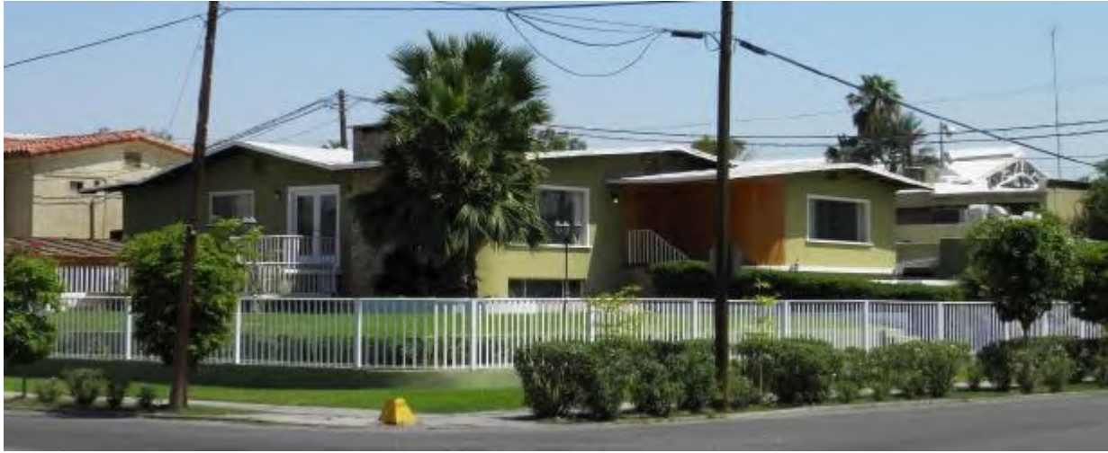
The "Brady Bunch House" circa 1940's

Notable residents of this neighborhood include the mayor of the city, and the official residence of the Governor of Baja California.