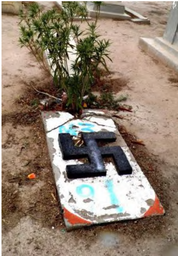
Unmarked grave at Pioneer Cemetery

However, an artifact at the Mexicali Municipal Cemetery No. 1 (Pioneer Cemetery) also gives rise to speculation to another twist in this dark period of human history. 27 While many of the gravestones in the cemetery harken back to the earliest settlers of Mexicali, there is one grave of particular local interest.