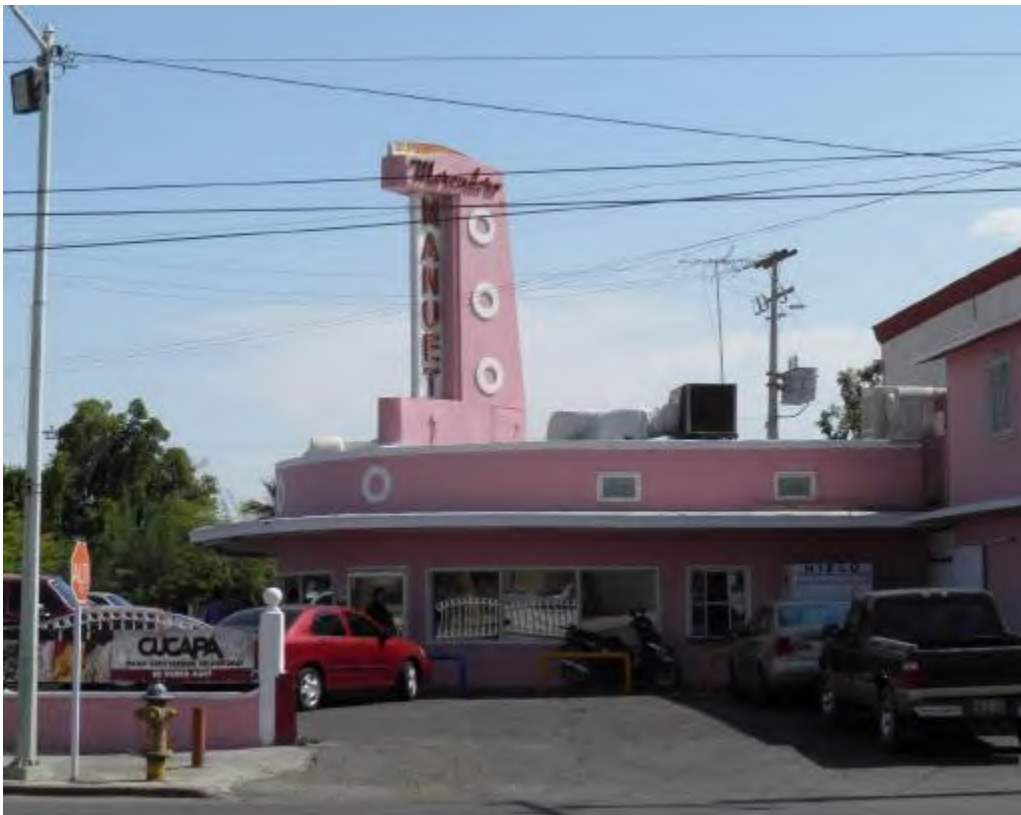
Manuets, a Mexicali classic

Manuets is the classic Mexican diner and has been serving traditional Mexican cuisine since 1949. Manuets has an extensive alcohol selection, and a friendly atmosphere. Prices are in the moderate range, and well worth the money.