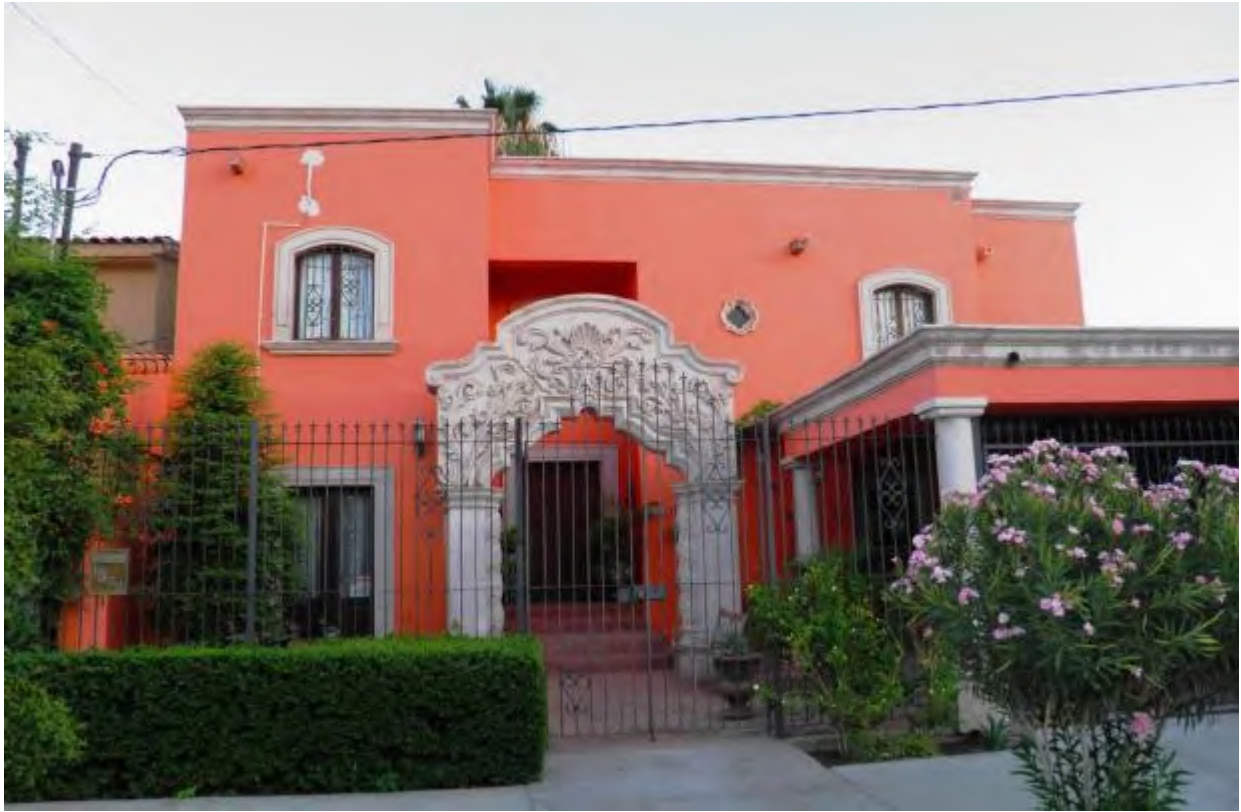
Another example of an amalgamation of styles