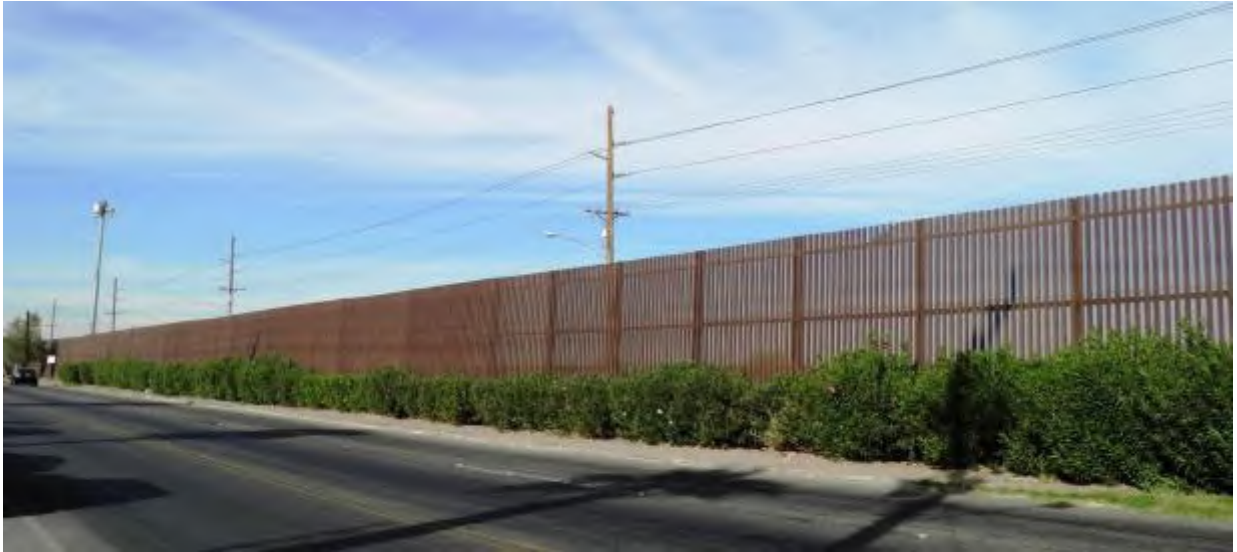
The border fence (Mexicali side)

Using an ATM or a credit card for currency exchange is a bad bargain – typically users can be charged as much as 5 % of their transaction.