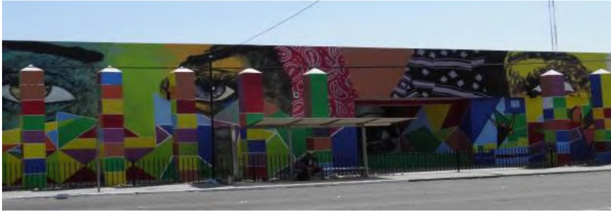
Museum (August 2012)