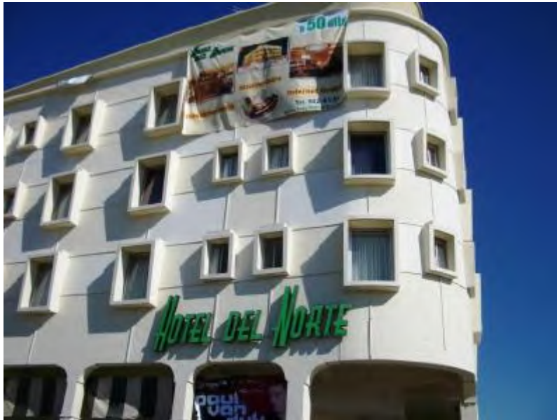
Hotel del Norte on calle Madero (2012)