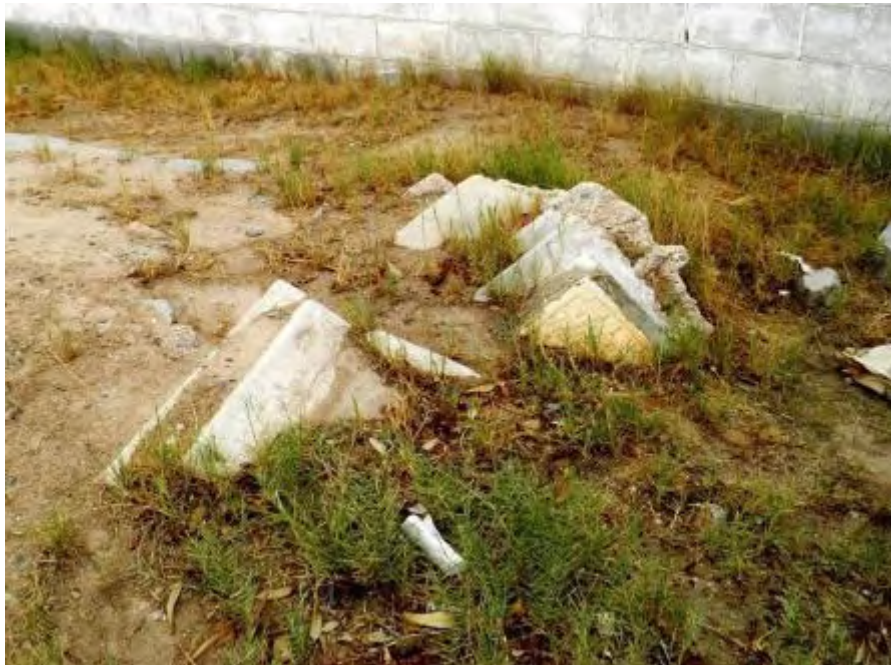
What remains of a pile of headstones removed to make way for new construction in the 1960's

In the 1960's, as land in central Mexicali became increasingly valuable, in a Poltergeist -like plot device, the headstones of several hundred graves were removed and piled in a corner of the cemetery. Large portions of the cemetery were paved over to make room for a school, police station and parking lot behind what is the cemetery today. The graves themselves were not disinterred due to the expense and effort involved.