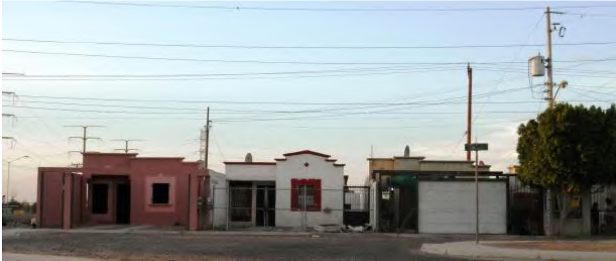
Home ownership expanded via a government program

In many neighborhoods, while the original layouts are identical, subsequent modifications have made the homes unique and not readily identifiable as clones of their neighbors.