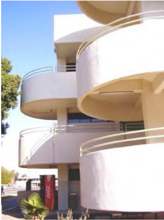
the School of Architecture