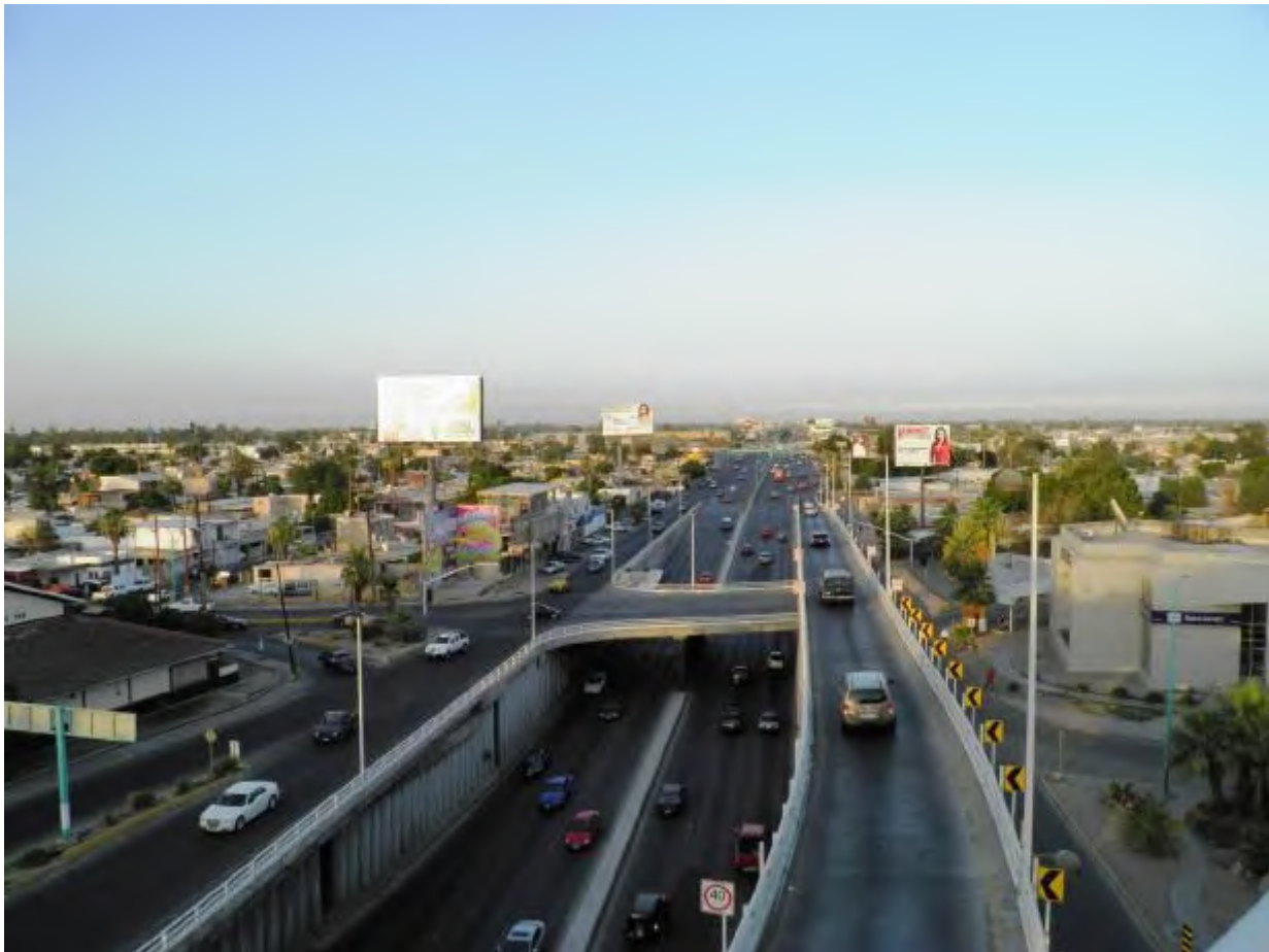
One of the main arteries that criss-cross Mexicali

Zona Hotelera lives up to its name. The main streets of this area, Justo Sierra and Benito Juarez are liberally dotted with elegant resort hotels, upscale restaurants offering a variety of international and Mexican cuisine along with perennial American favorites such as Applebee's, Subway, Pizza Hut and Burger King. Several new shopping areas and small clothing stores also line this major artery through the city.