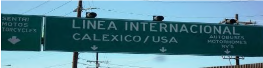
Returning to California by car may entail a lengthy wait

The US Border control maintains a website, www.apps.cbp.gov/bwt with estimated border wait times for motorists at each of the several crossing gates, but the actual time to cross are often twice the time listed. This site also posts the hours of operation. Generally, the border is closed from midnight to three am in the morning, but this may vary. The Mexicali papers also publish wait times, but these wait times are retrospective to the previous day, which may be less helpful for people traveling on weekends and holidays.