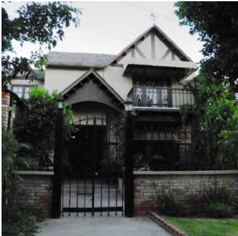
Tudor with a twist

With steep rooflines, and wood finishing on this concrete and stone exterior, the home tells an interesting story of traditional Tudor design adapted to local construction materials. Another example of the differing array of architectural styles in this neighborhood is the “Brady Bunch House”. Located near the UABC Museum, the home exemplifies the modern architectural style with glass and wood accents. This is one of few homes in Mexicali to be built on a sloping lot, in successfully incorporates the landscape features into the design of the home. The terraces give this home a “unique, simple and elegant” look (Robles, 2012).