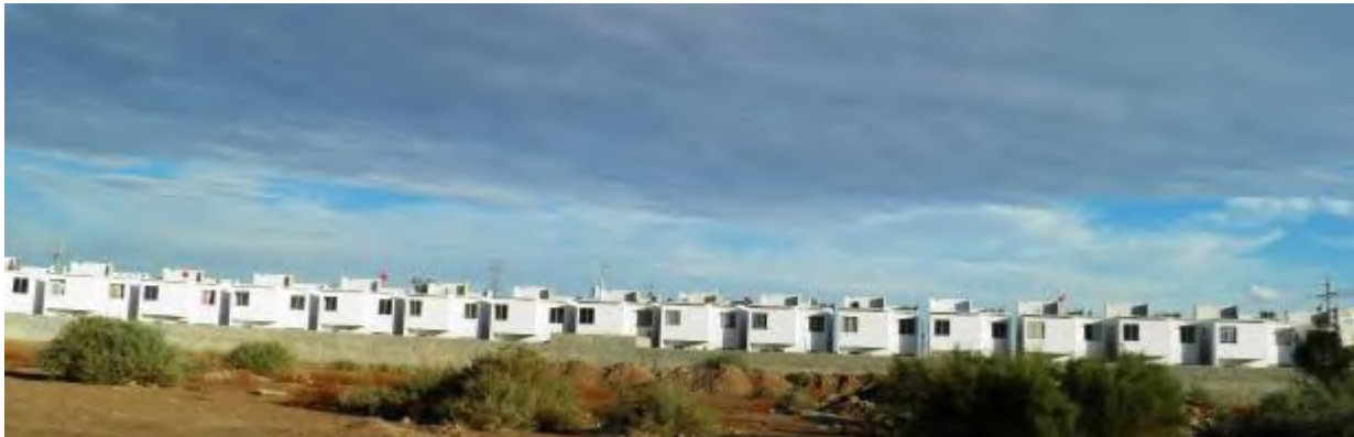
A row of identical homes on the outskirts of the city

In more recently developed areas of Mexicali, many homes retain their 'cookie-cutter' configurations similar to newer housing developments in the United States.