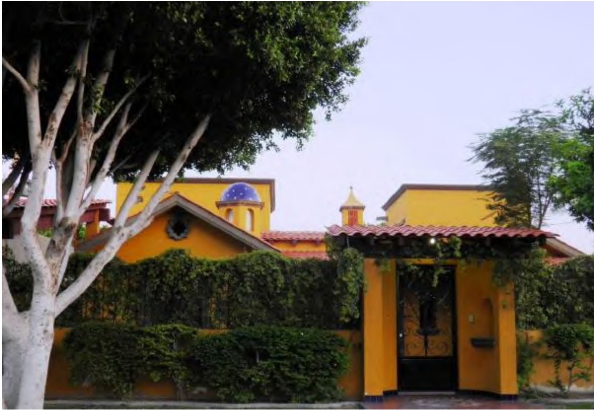
Culture, color and construction blend for a style unique to Mexicali

Another example of the changing architectural style in Mexicali is the orange-pink home on the next page. This home was initially built in the 1950's with a modern, streamlined style, as seen by the sharp detailed lines of the walls and flat roof. In the last few years, more classical Mexican hacienda architectural features such as the freestanding entryway arch that precedes the structure, as well as cornices and window frames of quarry stone have been added. The contrast between the richly colored walls of the home with the gray color of the natural stone adds to the architectural interest of this home.