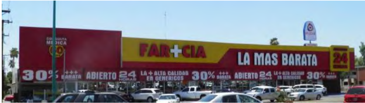
Chain pharmacy in Mexicali

While many people assume that all medications are cheaper in Mexico than the United States, this is not always true. In fact, with the popularization of four dollar medications at several large chains such as Target, Kmart and Wal-mart, many of these medications are significantly more expensive in Mexicali.