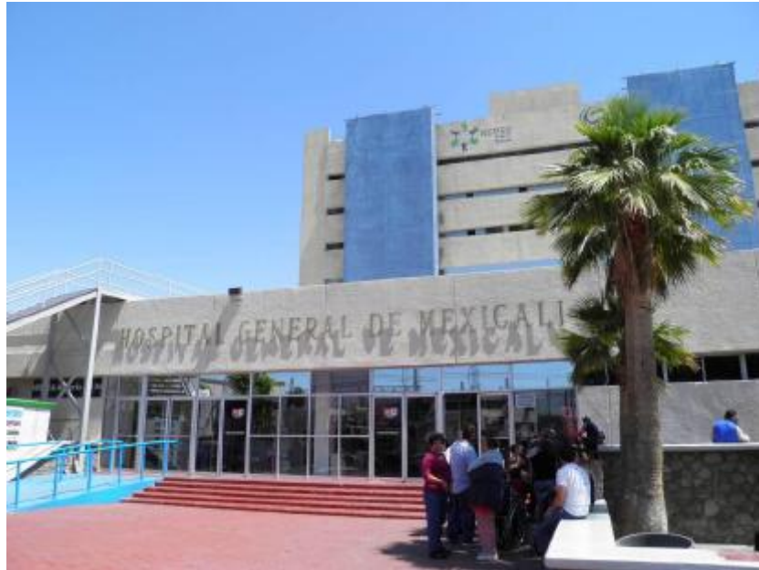
Outside Hospital General de Mexicali