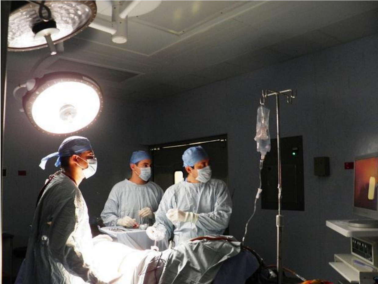
in the operating room

While the opinions and observations on the food/ cuisine and culture in Mexicali are just that: opinions, the information provided regarding surgeons and observations in the operating room are borne of years of training, education and experience.