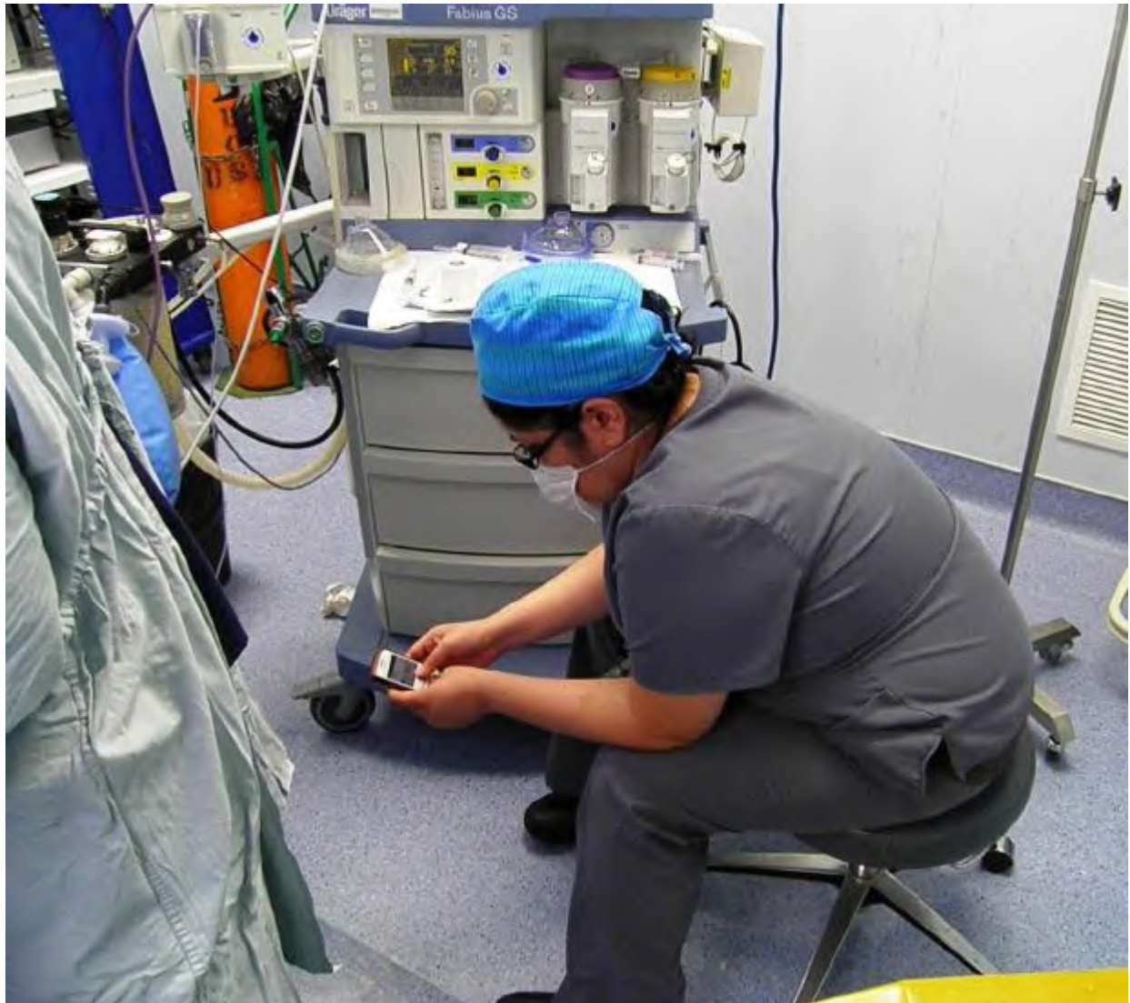
One of the reasons we monitor anesthesia while they monitor the patient 102

surgery with an aggressive approach to limit the development of complications. Whether this is the recognition of the need to secure the airway during conscious sedation, administer fluids or medications for intraoperative blood loss or low blood pressure, it is essential that the anesthesia provider be in-tune to the patient's needs and not his iPhone. 101