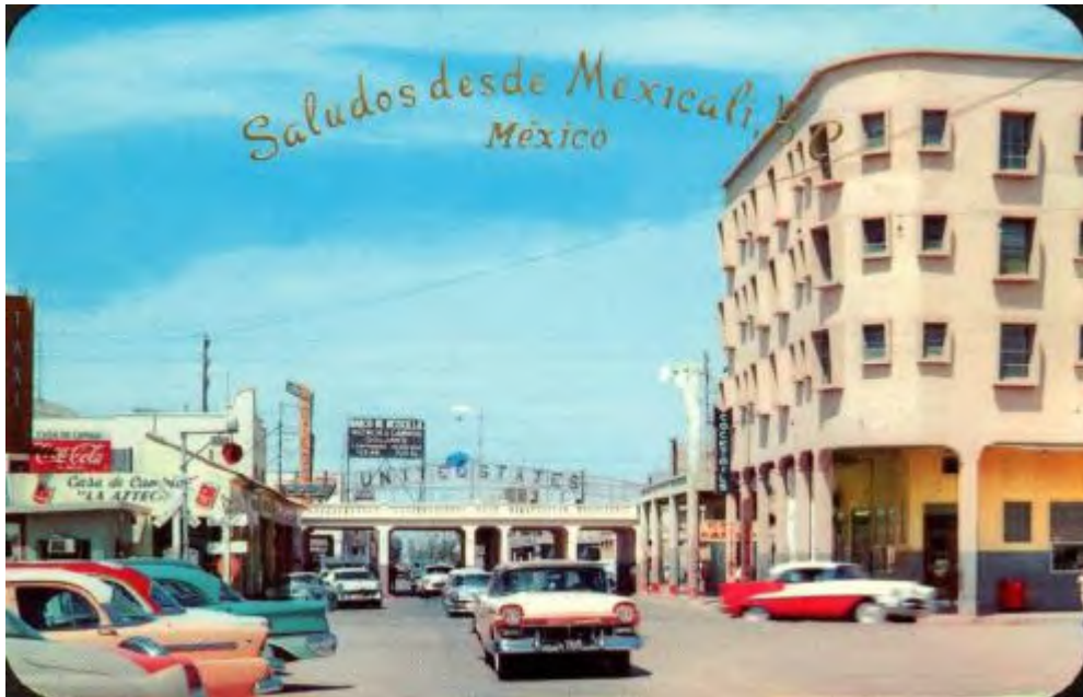
Postcard, circa 1952 showing main border crossing & Hotel del Norte

With the exception of Hotel del Norte – there are very few suitable hotels or places for weary travelers to sleep. The remainder of facilities offer hourly rates and are generally feature an array of chubby teenage prostitutes plying their trade during all hours of the day and night. The Hotel 16 de Septiembre is particularly notorious for this – with young, scantily clad girls draped around the doorway and on the stairs while an older, more haggard madam oversees her employees. Prostitution has been decriminalized in about 18 of the 32 Mexican states, including Baja California but is generally restricted to designated areas. 43